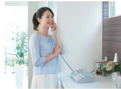
● Total solutions based on totally-electric conversion

Kansai EP Group efforts bring greater ease and convenience to our customers' lives. For example, K-Opticom's "eo HIKARI" provides secure and dependable information communication services (FTTH) that use its own optical fiber network extended to the whole Kansai region. The optical fiber network, used for Internet, telephone and TV, plays a center role of the large-bandwidth communication. K-Opticom centrally monitors and manages its network 24/7 to ensure secure and dependable services.