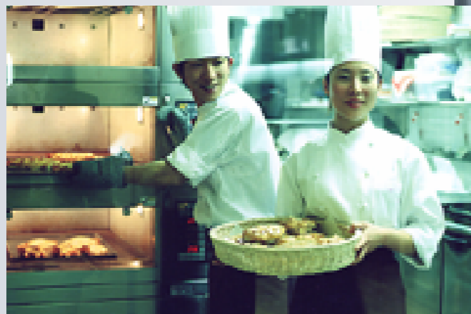
Electrical cooking equipment

Going forward, we will continue to work in collaboration with the full complement of our Group affiliates to develop and provide an ever richer menu of high value-added solutions to meet the evolving needs of the business community.