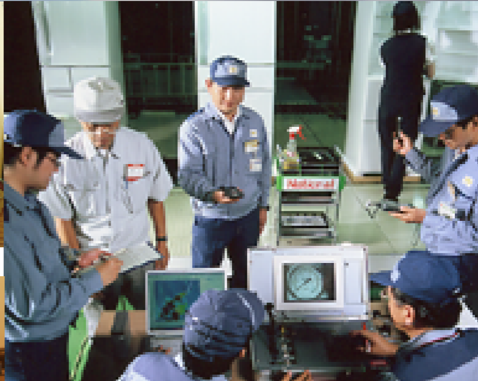
Energy equipment diagnosis