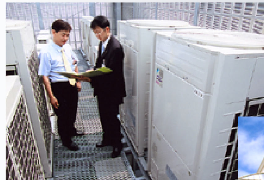
"Eco Ice" thermal storage system