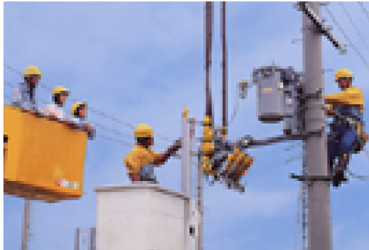
Observation of distribution line work

Our joy is to bring joy to the lives of all local citizens.