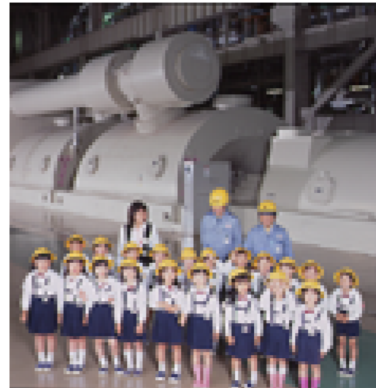
Tour of Nanko Power Plant by area children