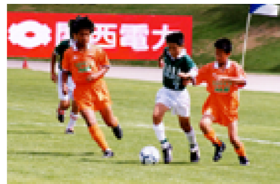
Youth soccer game