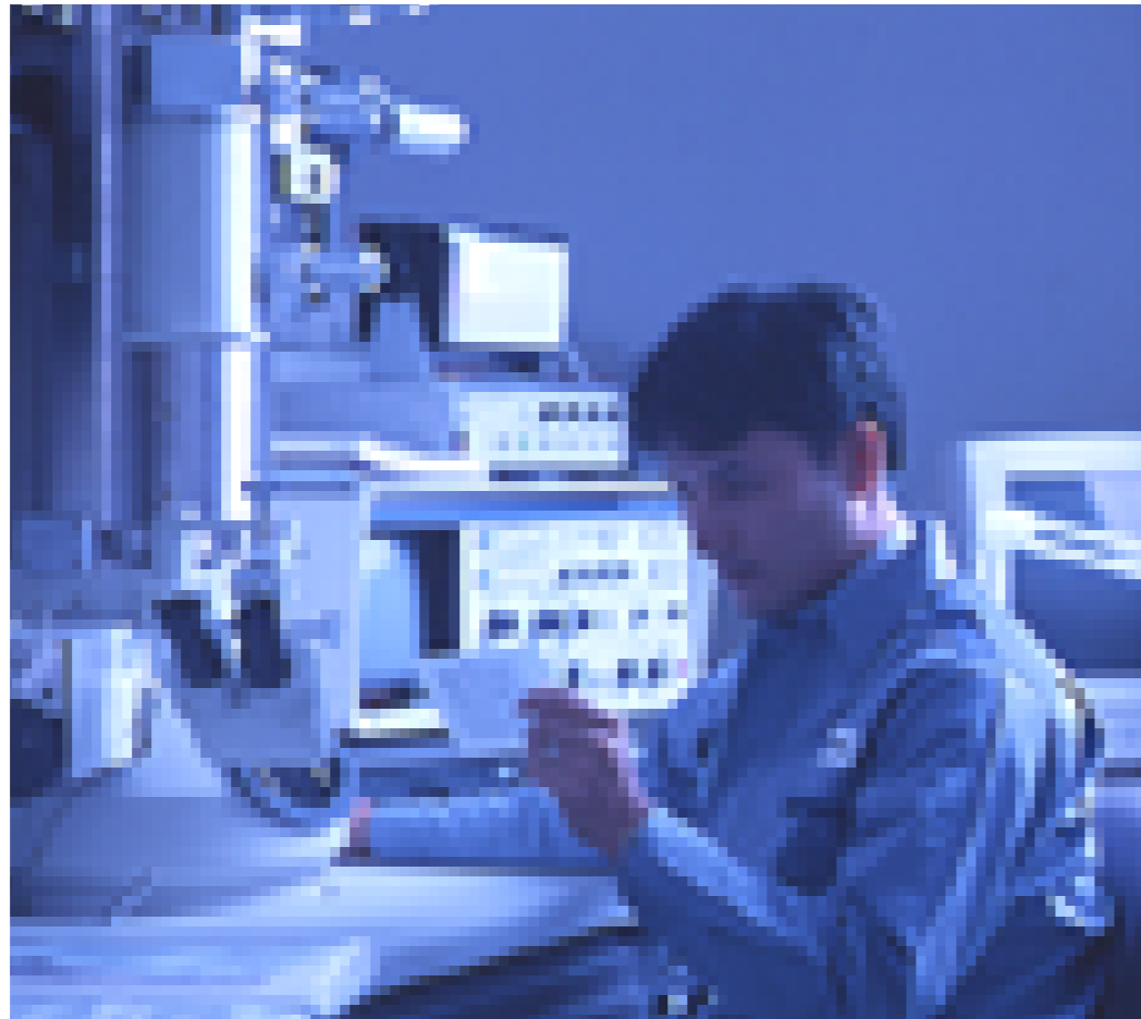
Metal fatigue inspection by electron microscope

We continuously explore exciting new possibilities for tomorrow.