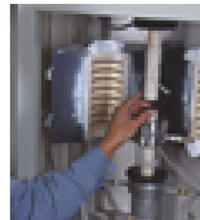
Basic research into SOFC materials