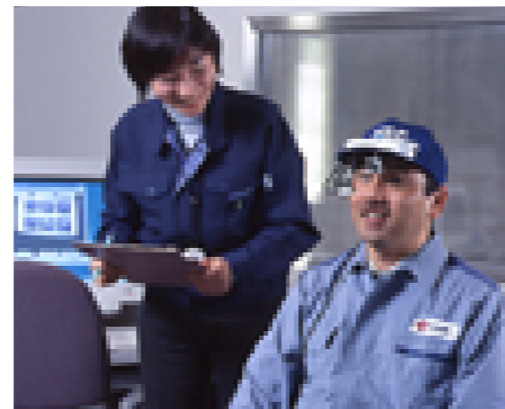
Research into human error