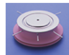
SIC diode module testing