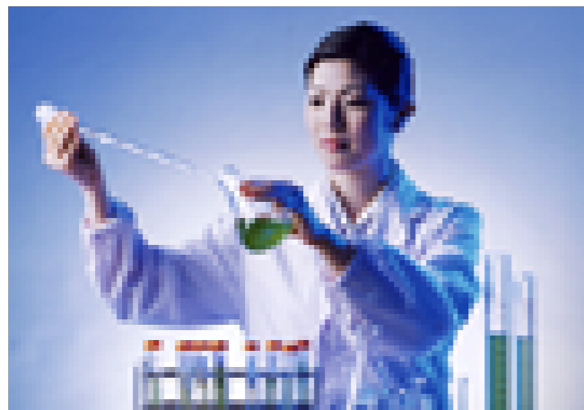
Development of soil decontamination technologies

Relying on its advanced technological capabilities and vast expertise accumulated through half a century, Kansai EP engages in R&D on kaleidoscopic fronts, in a continuing quest for new products offering economic and other benefits to society.