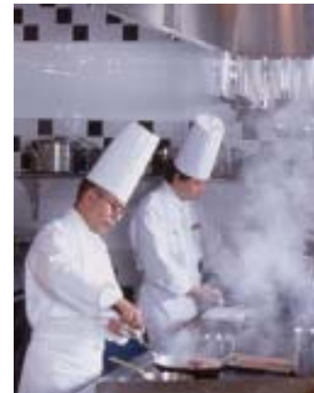
Electrical cooking equipment