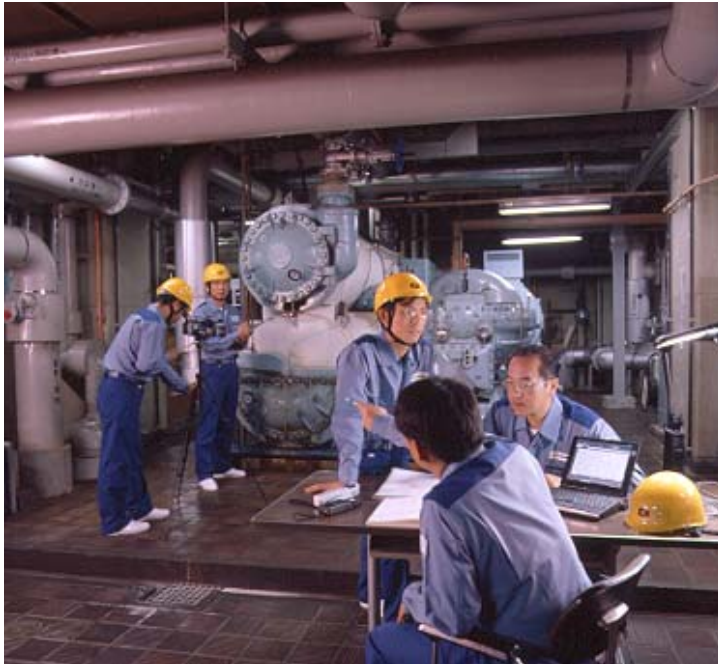
Energy equipment diagnosis