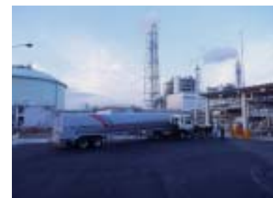
Gas shipment by tanker truck (Himeji Storage Depot)