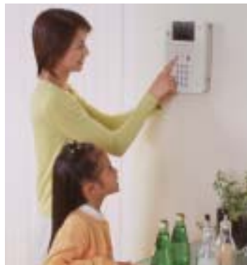
Home security services (KANDEN Security of Society)