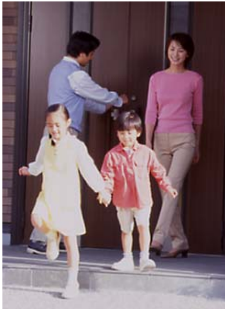
Housing performance evaluation / indication services (Kansai Jyutaku Hinshitsu Hoshu)