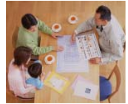
Home remodeling to electrical installations (KANDEN EHOUSE)